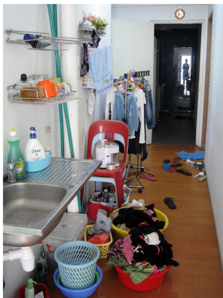
Fig. 4. The entrance of Oanh's apartment (2010).

of selling sex is not prohibited. However, public soliciting is an offence under the Miscellaneous Offences Act and so are procuring and trafficking under the Women's Charter. On the ground, the government enforces a containment policy (Bin and Gill, 2014). It allows a small number of brothels to operate in four designated red-light areas and to recruit women from China, Thailand and Bangladesh (and Vietnam since 2016) under a 'Work Permit for Performing Artist' scheme. However, the authorities persecute sex workers who solicit outside designated areas (Asia One, 2013; One, 2012; Khoo, 2011). If the arrested sex workers are foreigners, the police confiscate their passport, provide them with a notice explaining they are required to leave