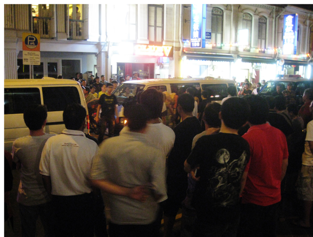
Fig. 7. The Immigration police conducting a raid in the Blue Zone stretch. Two sex workers from Oanh's network were arrested and expelled from Singapore (2010). (For interpretation of the references to colour in this figure legend, the reader is referred to the web version of this article.)

Singapore at their own expense, and prohibit them from returning. Altogether, these obstacles compelled Vietnamese sex workers to engage in circular migration despite their desire to remain in Singapore