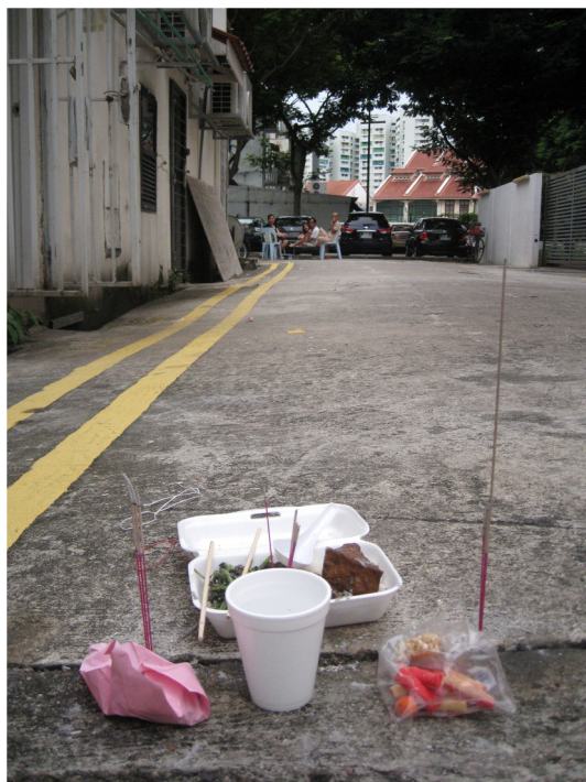
Fig. 3. Oanh leaves food and incense sticks at the entrance of her apartment during the hungry ghost festival. The members of another quasi-family network sit and chat in the background (2010).