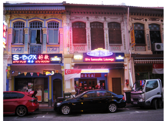
Fig. 1. The Blue Zone stretch on Joo Chiat Road. The popular Blue Lagoon pub closed its doors in late 2010 (2010, all photos from author). (For interpretation of the references to colour in this figure legend, the reader is referred to the web version of this article.)

The study of the economic and temporal features of the migration package that the sex workers purchased on credit from their broker shows that this transaction was rational and profitable for both parties, and thus economically ‘safe’. This transaction took place in a context of circular migration and repression. The chief pull factor for Vietnamese