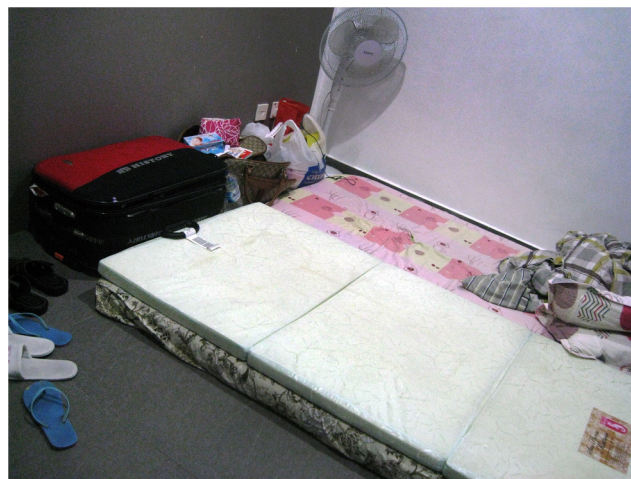
Fig. 5. A sex workers' room in Oanh's apartment. Two women shared a single mattress. They placed their belongings at the bottom of the bed (2010).

of selling sex is not prohibited. However, public soliciting is an offence under the Miscellaneous Offences Act and so are procuring and trafficking under the Women's Charter. On the ground, the government enforces a containment policy (Bin and Gill, 2014). It allows a small number of brothels to operate in four designated red-light areas and to recruit women from China, Thailand and Bangladesh (and Vietnam since 2016) under a 'Work Permit for Performing Artist' scheme. However, the authorities persecute sex workers who solicit outside designated areas (Asia One, 2013; One, 2012; Khoo, 2011). If the arrested sex workers are foreigners, the police confiscate their passport, provide them with a notice explaining they are required to leave