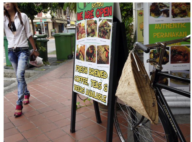
Fig. 2. A Vietnamese migrant is walking on Joo Chiat Road (2013).

sex workers to migrate to Singapore was the expectation of high earnings. Their goals were to earn money themselves and for their parents, to repay personal and family loans, and to save to invest in small business ventures in Vietnam. Other reasons included the desire to find a generous patron after a marital dissolution and to travel and ‘have fun’ ( đi chơi ) abroad. The city-state was for them an Eldorado as encapsulated in the saying ‘going to Singapore, easy to earn money’ ( đi Singapore dễ kiếm tiền ). All the sex workers from my sample (except one to which I will return) knew their migration to Singapore would involve sex work. Their situation could be described as ‘indentured mobility’ (Parreñas, 2011), as it entailed structural coercion caused by poverty and limited skills and options, but also choice and agency as they migrate knowingly and willingly without being lured, coerced and trafficked.