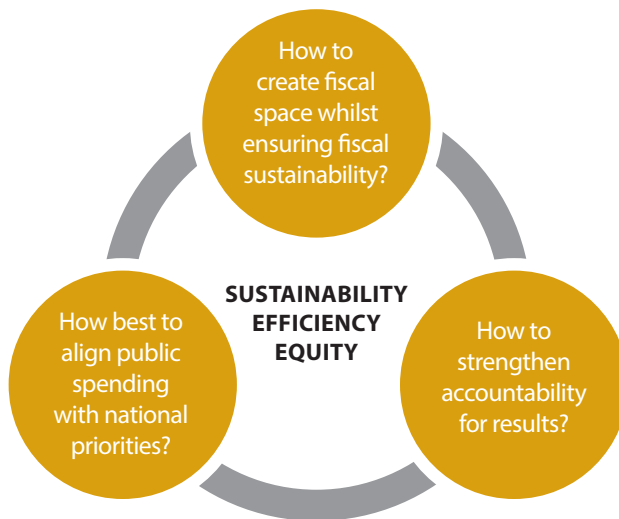
The three main questions of the PER

net contributors and net recipients). The main findings and 68 recommendations of the 15 chapters have been endorsed by the Prime Minister for relevant ministries and provinces to implement in the coming years. The main findings and recommendations are summarized around the three anchor questions as follows: