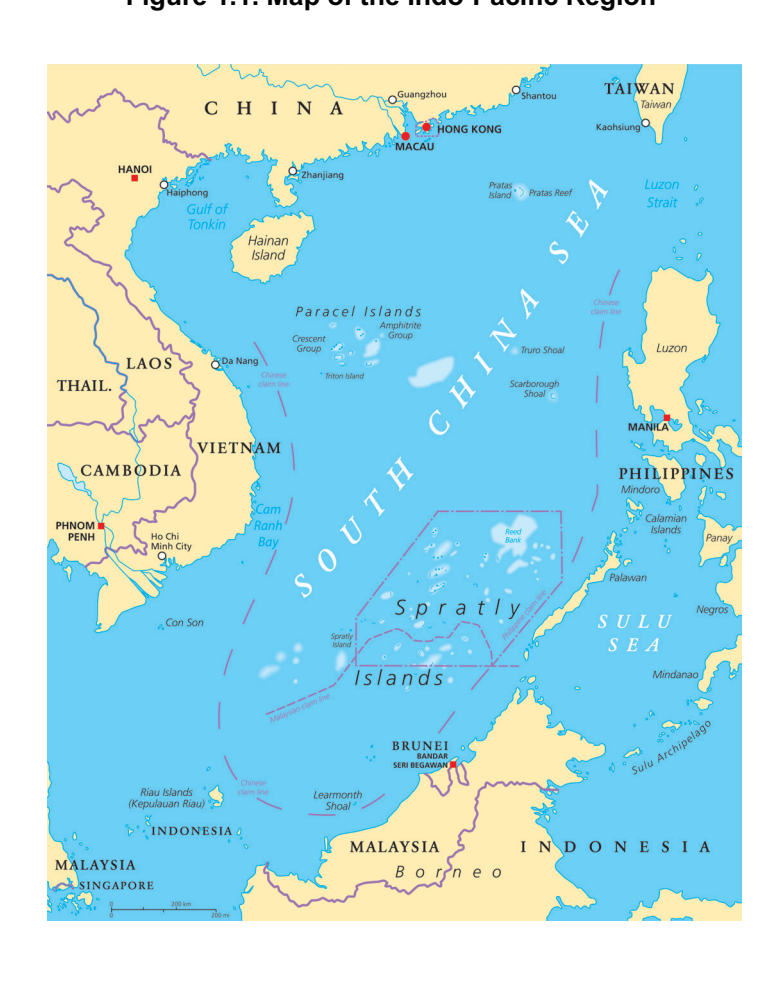
Figure 1.1. Map of the Indo-Pacific Region

transformed Vietnam from one of the world's poorest nations to a lower middle-income country." Vietnam's GDP, now approximately $241 billion, has increased 30-fold in the past three decades, and its total trade stands at approximately $527 billion. Vietnam has been called an "Asian tiger" and is now ranked 45th in GDP. Indeed, these are truly remarkable developments considering that, in 1988, the country had approximately 3 million people suffering from starvation and 5 million malnourished within its borders. Separately, and most recently, Vietnam has served as a model to the world on how to effectively mitigate the negative impacts of the coronavirus pandemic.