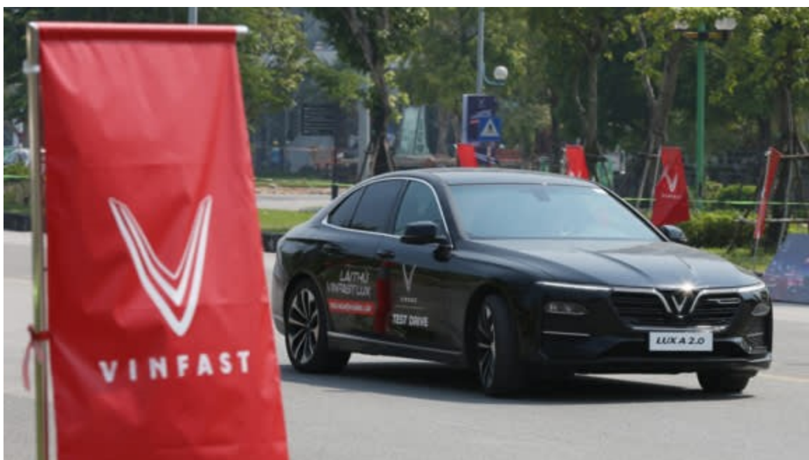
Vingroup has moved into auto manufacturing with big-name foreign partners.

One common factor is that they studied abroad in former Communist bloc countries. Vingroup's founder Vuong studied in Moscow, and started a restaurant business in Ukraine. He soon developed it into the production of instant noodles and then the development of dehydration apparatus used to make instant noodles. In 2009, he sold his company that dealt in dehydration systems to Nestle, a Swiss multinational food and beverage company, for $150 million, making the seed money to start a real estate business.