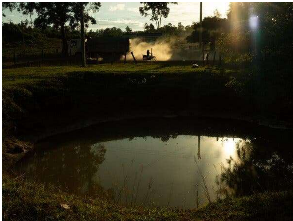
A bomb crater near Phonhai, a village in Savannakhet Province. These craters are everywhere in Laos, and this one most likely came from a B-52 bombing mission.

So far, these conversations with officials have been informal, but this month she plans to submit the group’s findings to both governments, documenting the extent of the spraying recorded in the Air Force records and the number of disabilities the War Legacies Project has found. That’s when the governments of the United States and Laos will no longer have any reason to avoid taking action that is long overdue.