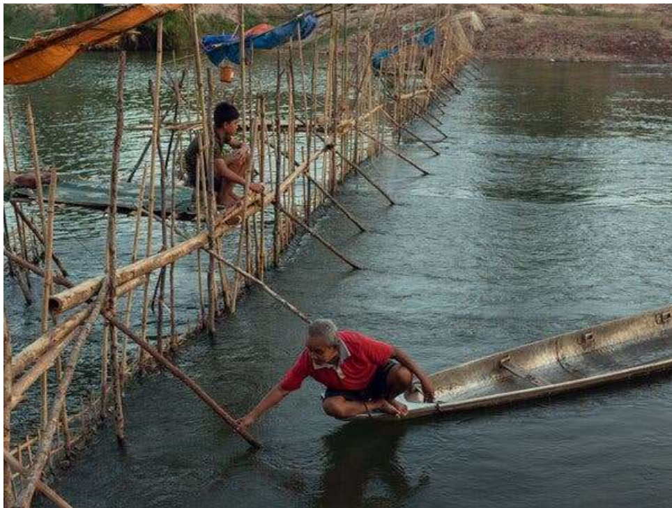
A fishing boat and fish trap on the Xepon River in the village of Dong-Gnai. The boat is made from the external fuel tank of an American fighter bomber, possibly an F-4 Phantom. The tanks were jettisoned by pilots when they were empty or to reduce weight.

The United States' relationship with Laos has followed a similar sequence. Since the late 1980s, joint American-Lao teams have conducted hundreds of missions searching for the remains of aircrew who went missing on bombing missions, and over the last quarter-century Washington has committed more than $230 million to ordnance removal and related programs. The missing step has been Agent Orange, but lacking any data on its human impact, the Lao government has had little incentive to raise such a historically fraught issue. Few government soldiers fought in the sprayed areas, which were controlled by the North Vietnamese, so there were no veterans clamoring for recognition of their postwar sufferings. "In Vietnam, the magnitude of the problem made it impossible to ignore," Hammond says. "But in Laos it was on a smaller scale, and in remote places outside of the political mainstream."