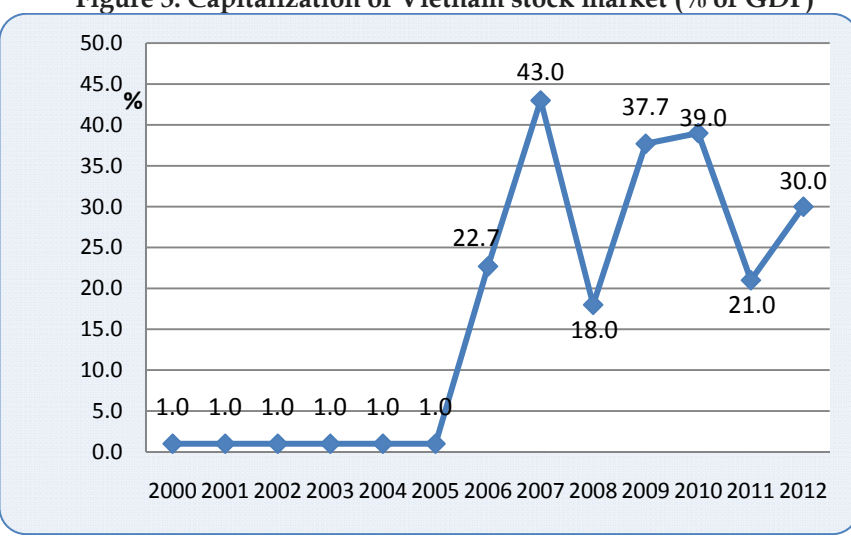
Figure 3: Capitalization of Vietnam stock market (% of GDP)

bubble risks. Despite immense risks, the market continued to go high as capital gains were still made easily, and macro prospects looked bright with Vietnam joining WTO soon (Pham and Vuong, 2009).