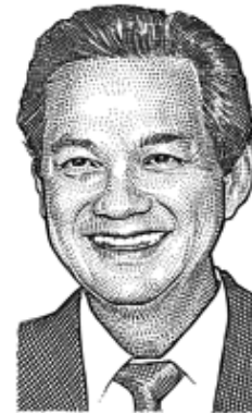
Nguyen Tan Dung

Mr. Dung began his career as a child soldier in 1961, signing up as a messenger with the Viet Cong guerrillas when he was 12 years old. He rose through the ranks to become a political commissar, and was wounded several times in battles with U.S.-backed southern Vietnamese troops in the 1960s and 1970s. His army bosses sent the young Mr. Dung to the Communist Party's elite leadership academy, and he became the youngest-ever member of Vietnam's 14-member Politburo. He became prime minister in 2006 at the age of 56.