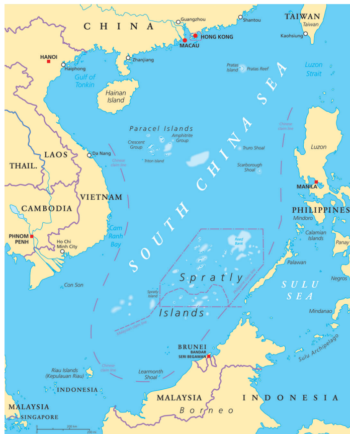
Figure 1.1. Map of the Indo-Pacific Region

transformed Vietnam from one of the world’s poorest nations to a lower middle-income country.” 6 Vietnam’s GDP, now approximately $241 billion, has increased 30-fold in the past three decades, and its total trade stands at approximately $527 billion. 7 Vietnam has been called an “Asian tiger” and is now ranked 45th in GDP. Indeed, these are truly remarkable developments considering that, in 1988, the country had approximately 3 million people suffering from starvation and 5 million malnourished within its borders. 8 Separately, and most recently, Vietnam has served as a model to the world on how to effectively mitigate the negative impacts of the coronavirus pandemic.