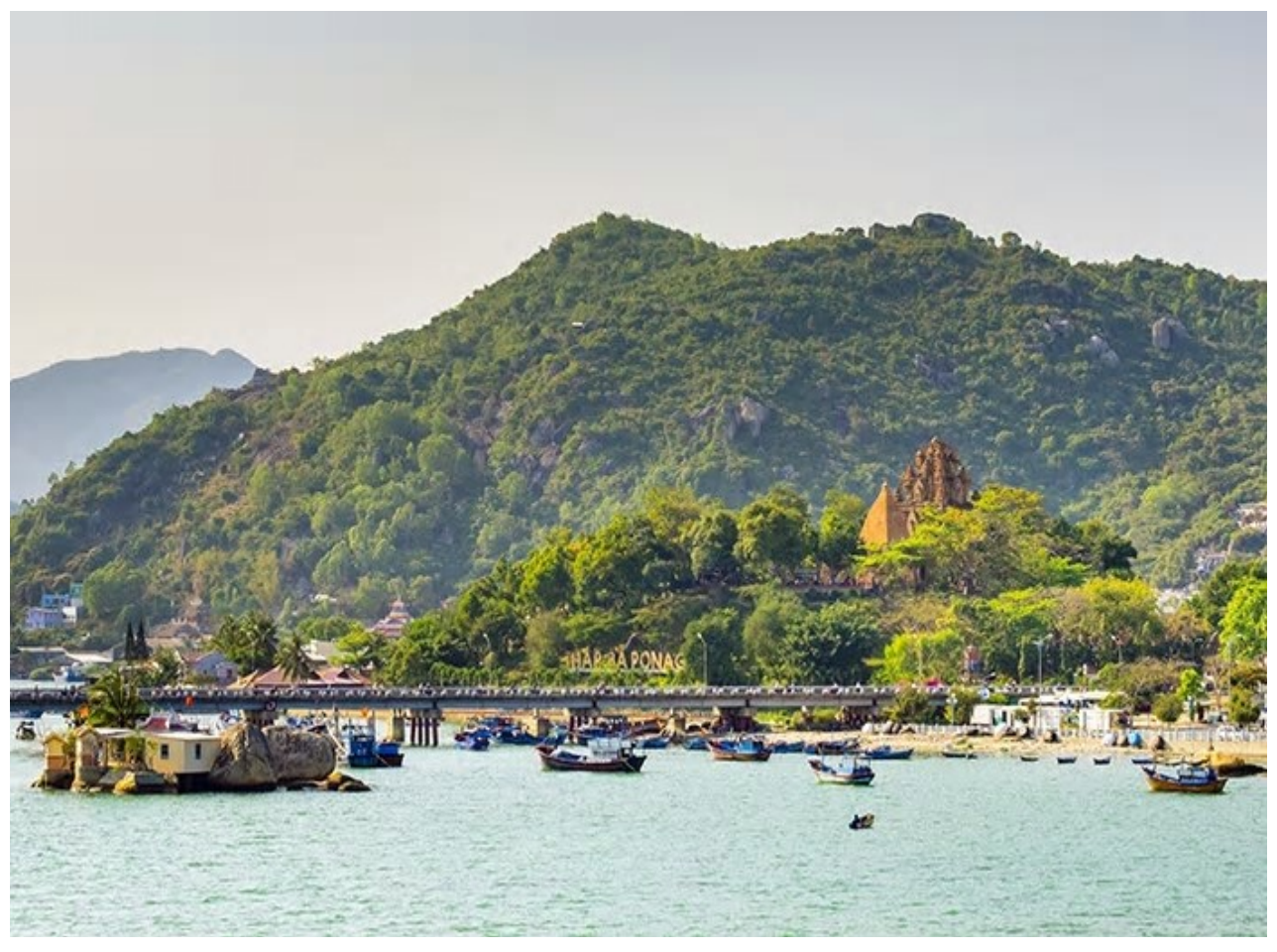
Po Nagar temple and Cai river, Nha Trang in Khanh Hoa Province

been bought by the end of 2017, compared with about 90 per cent of the 1,100 available at the end of 2016.