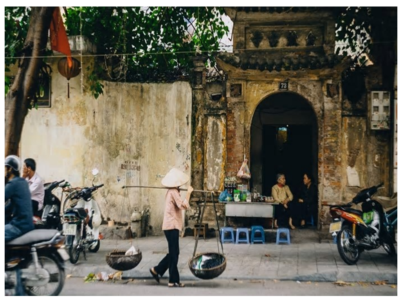
A street in the Old Quarter of Hanoi

Two factors are behind the increase. In 2015, the Vietnamese government introduced laws that made it easier for foreigners — and wealthy Vietnamese expats — to buy property. Meanwhile, ever-rising real estate prices in places such as Hong Kong, Thailand and Sydney are encouraging middle-class Asian buyers to look further afield for holiday homes or investment properties. Vietnam, with its historic cities and relatively undeveloped tracts of coast, has come into focus as a leisure destination.