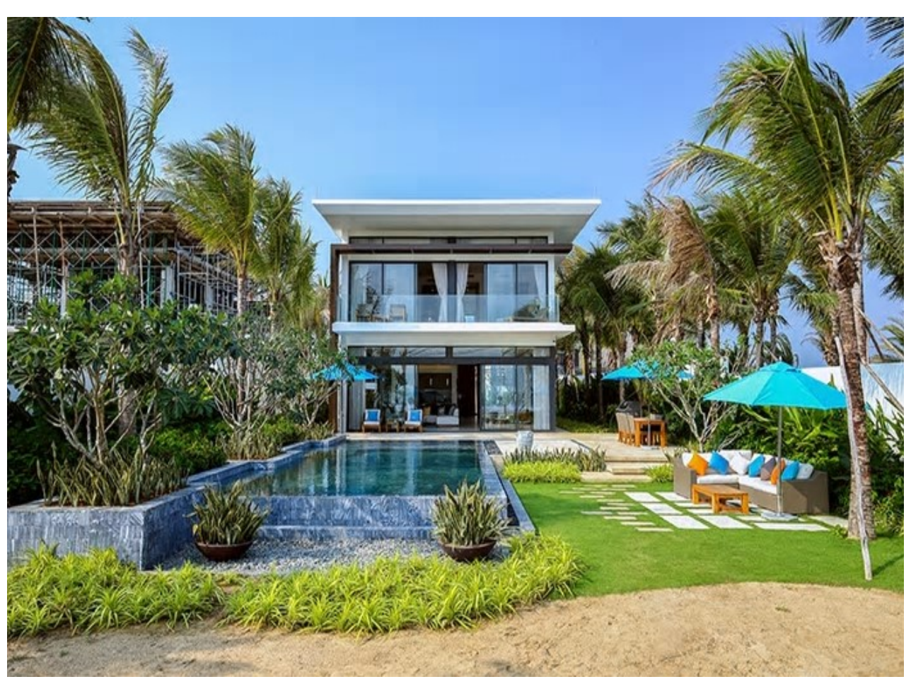
Beachfront villas at Melia Ho Tram at the Hamptons resort start at $790,000

This isn't the first time developers have courted foreign investment. When Vietnam joined the WTO at the beginning of 2007 direct and indirect investment flooded into the country. House prices rocketed. Then the financial crisis hit in 2008 and investors took flight, contributing to a five-year slump that saw the price of new apartments in HCMC fall 30 per cent and older stock in some regions lose even more value.