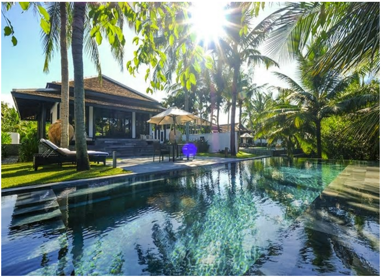
One-bedroom villa at a Four Seasons-branded resort in Hoi An, $850,000

outskirts of Da Nang, IndoChina Properties is selling a one-bedroom villa with a pool and access to resort facilities for $850,000.