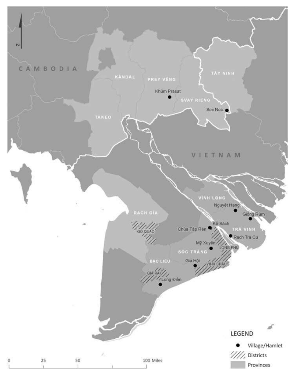
Figure 1. Sites of Khmer-Vietnamese violence, 1945–47. The map above shows provinces, particular districts, and villages mentioned in this article in both Cambodia and Vietnam in which Khmer-Vietnamese violence broke out. The map is not comprehensive. Map created by Nuala Cowan based on data supplied by the author.

Sóc Trăng (Lê Hương 1971, 252). To these places General Trần Văn Trà adds Rạch Giá and Tây Ninh Provinces, as well as the Cambodian areas near the border with Tây Ninh (Trần 1999, 59–60; 2006, 179). All of these areas had significant concentrations of Khmer. At least one province with a small Khmer population, Vĩnh Long, also saw Khmer killings of Vietnamese (Đảng ủy-Bộ Chỉ Huy Quân Sự Tinh Vĩnh Long 1999, 1:56). Finally,