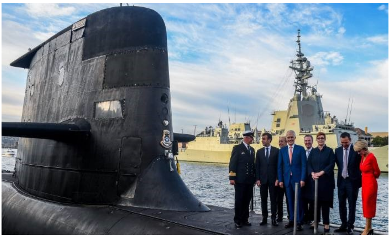
Former Australian prime minister Malcolm Turnbull, fourth from left, on the submarine HMAS Waller Separately, Australia and New Zealand are directing development aid to the South Pacific, where Beijing funnelled at least $1.7bn between 2006 and 2016.

power and influence — while in 2016 the Obama administration lifted its arms embargo on Vietnam, reflecting Washington's push to bolster ties with countries in the region to counter Beijing's growing economic influence and strategic power. In return, Hanoi opened its ports to visiting US warships for the first time since the end of the Vietnam war.