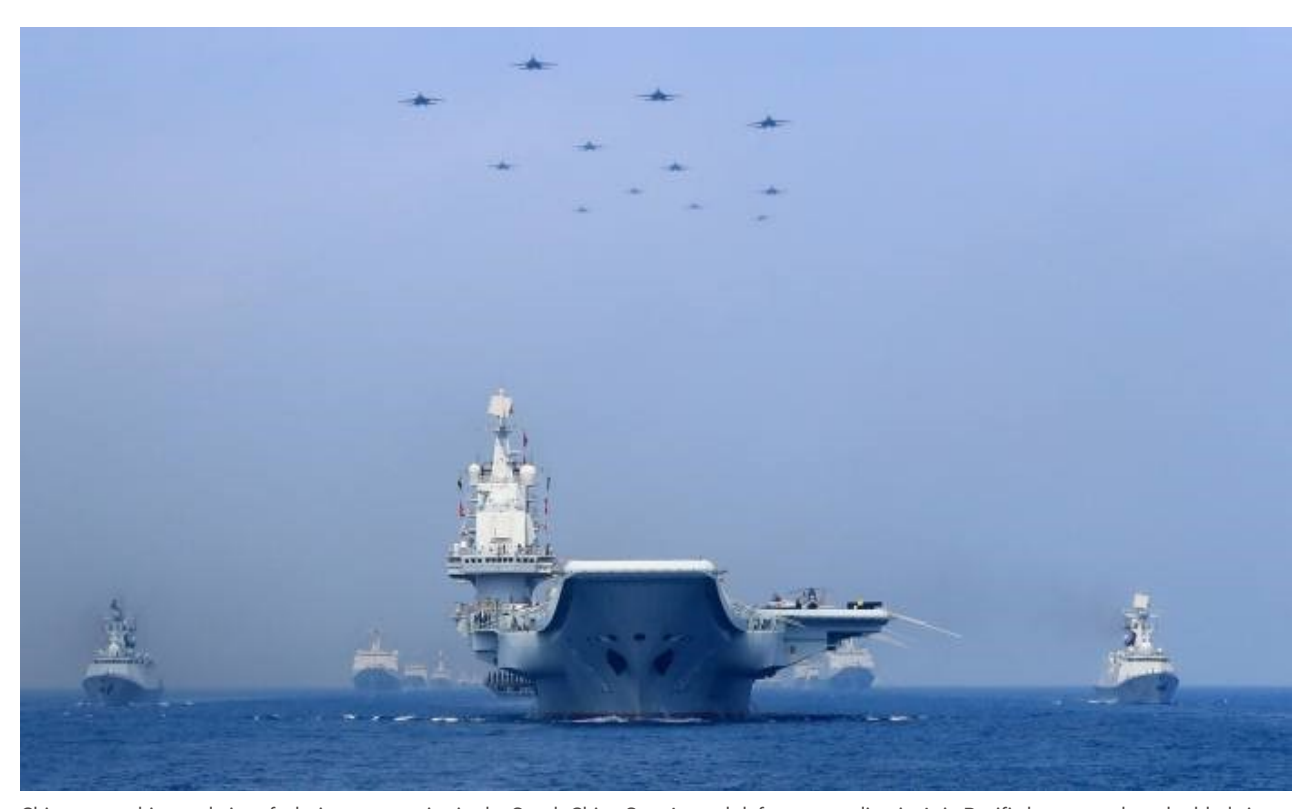
Chinese warships and aircraft during an exercise in the South China Sea. Annual defence spending in Asia Pacific has more than doubled since the turn of the century to $450bn — more than $200bn of that by China

For the moment there seems little prospect that a nuclear deterrent will be embraced due to opposition from Moon Jae-in, South Korea's president. But a breakdown in talks between Washington and Pyongyang could reignite the nuclear debate.