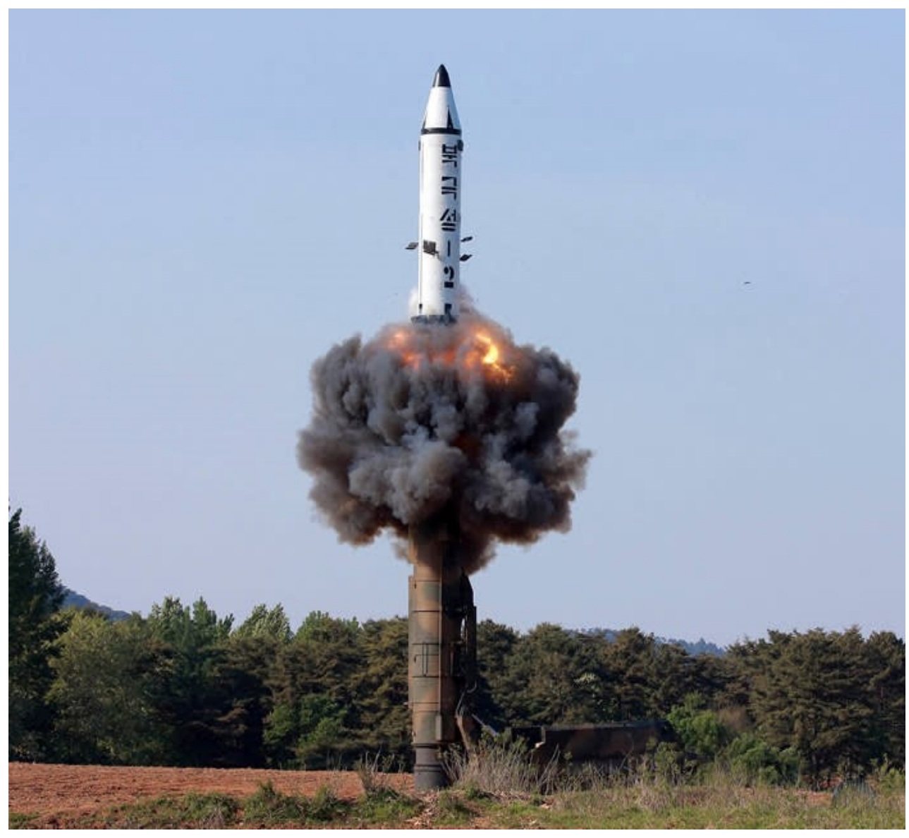
A missile launches in North Korea. Across Asia Pacific countries have been reacting to China's growing power and Pyongyang's nuclear threat In December Tokyo approved a ¥5.19th defence budget under prime minister Shinzo Abe, who is pushing to revise the nation's <u>pacifist constitution</u>. Although it has yet to go beyond 1 per cent of GDP the Japanese budget includes money to buy cruise missiles for its F-35 stealth fighter jets, which would provide Tokyo — for the first time — with the capability to strike land or sea targets in North Korea and China.

In South Korea a public debate erupted last year over whether the country should develop its own nuclear deterrent to counter Pyongyang. A Gallup Korea poll in September 2017 showed three in five South Koreans favoured building nuclear weapons, while a poll by YTN, a TV news channel, showed 68 per cent favoured redeploying US tactical nuclear weapons, which were withdrawn in the early 1990s.