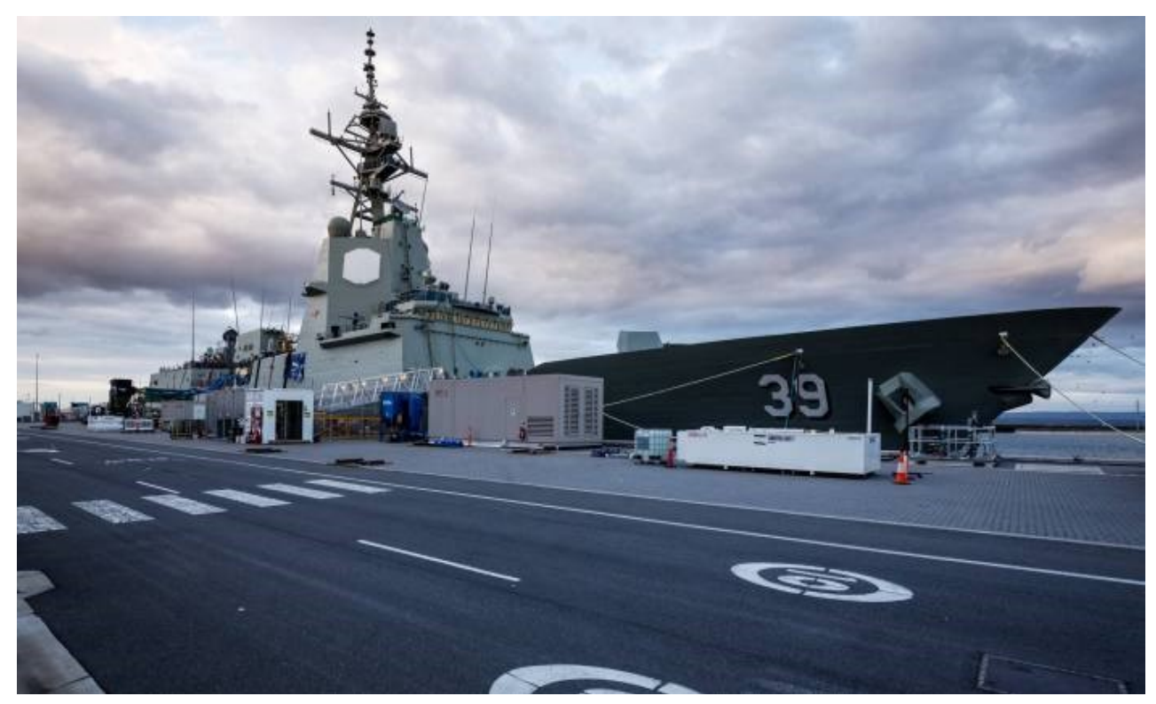
HMAS Hobart. In July Australia ordered nine new Type 26 frigates from BAE He says the US is right to ask its allies to do more.

"I've never seen weakness as being a promoter of peace," says Mr Pyne. "The history of the world tells us [that] to protect your national security, you have to be strong."