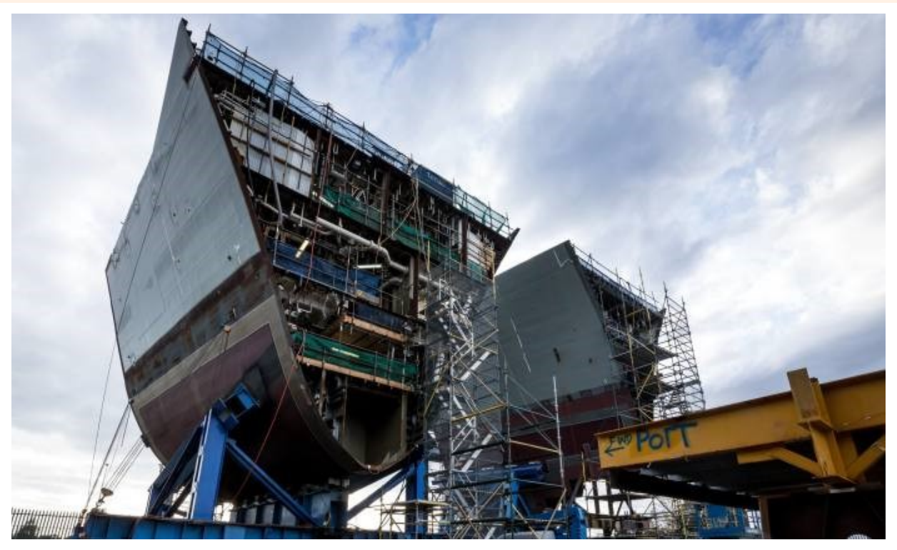
HMAS Sydney, an air warfare destroyer, under construction in Adelaide