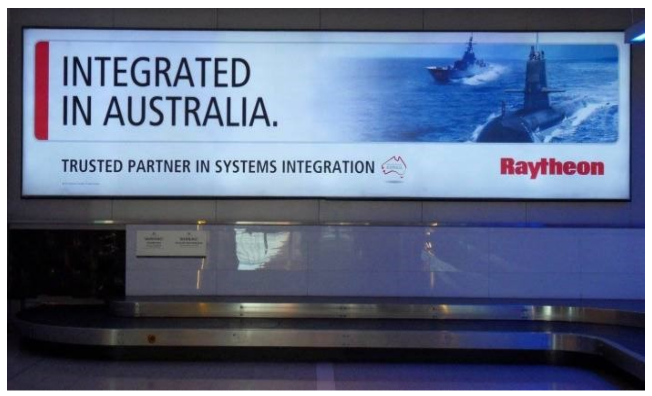
The blitz of defence adverts has prompted a 'No Airport Arms Ads' campaign to try to persuade Canberra airport to replace them with a 'friendlier greeting to the nation's capital'

They are also hiring thousands of staff and establishing new manufacturing operations to help deliver Canberra's strategy to create one of the most capable armed forces in Asia Pacific and transform Australia into one of the world's top 10 arms exporters. It is currently ranked 19.